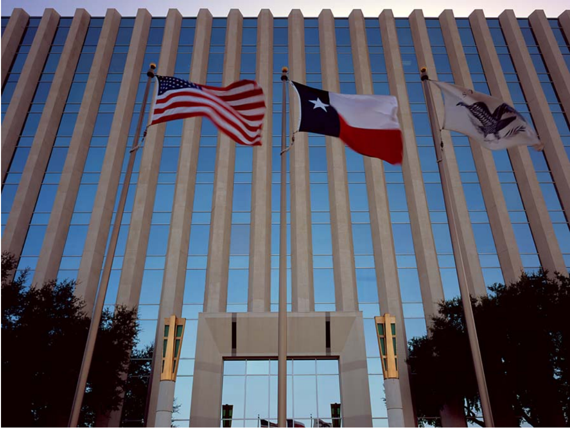
Facility Description of Telx's ColoXchange Center at 8435 Stemmons Freeway, Dallas, TX